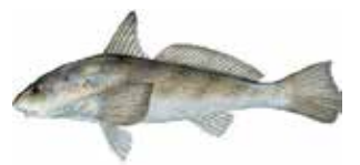
Southern Kingfish (Whiting)